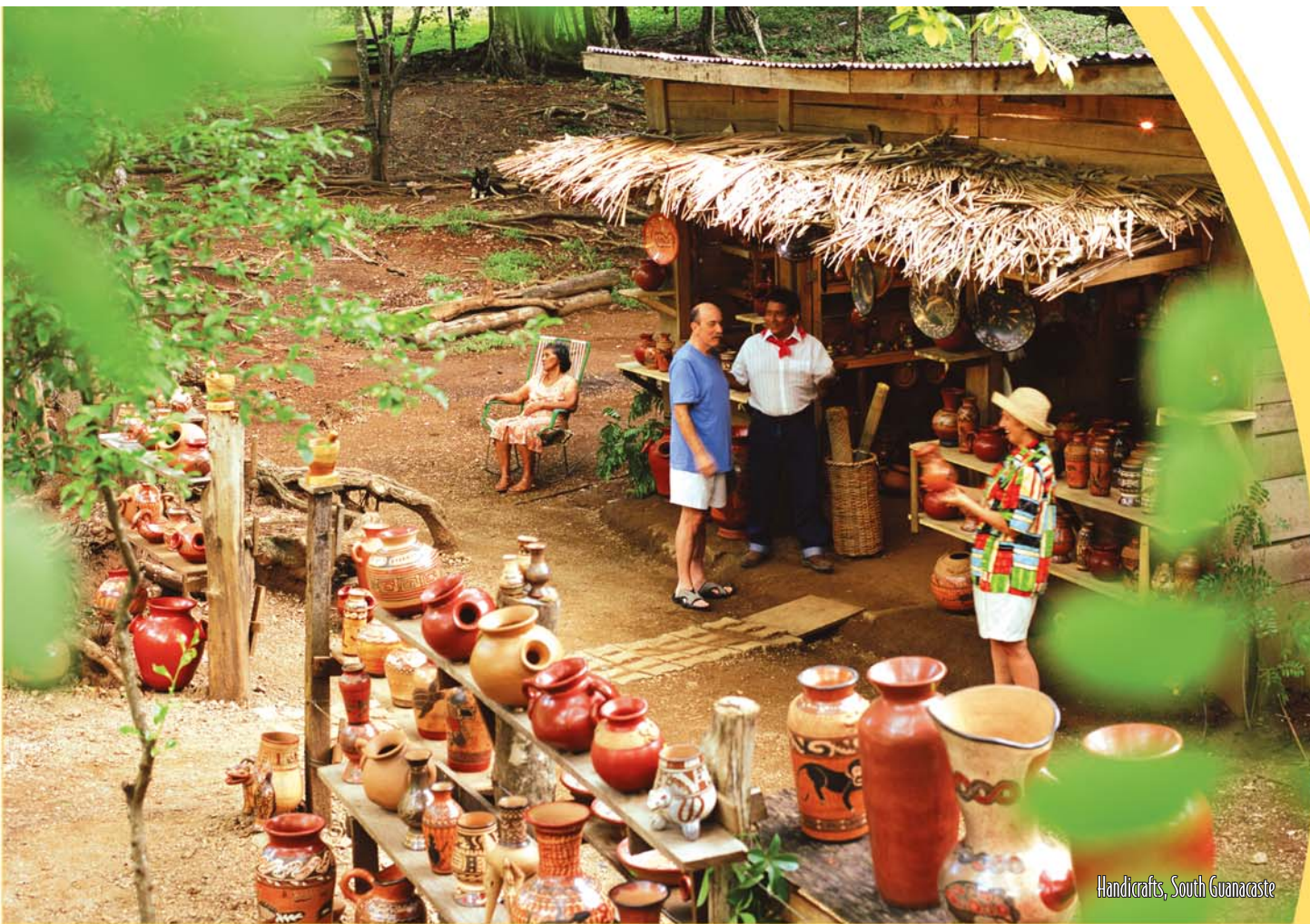
Handicrafts, South Guanacaste