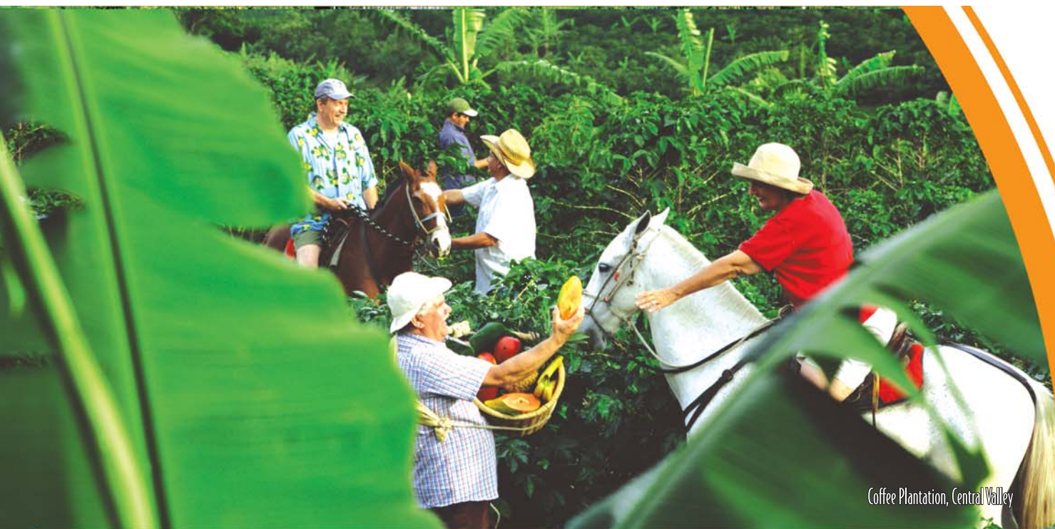
Coffee Plantation, Central Valley