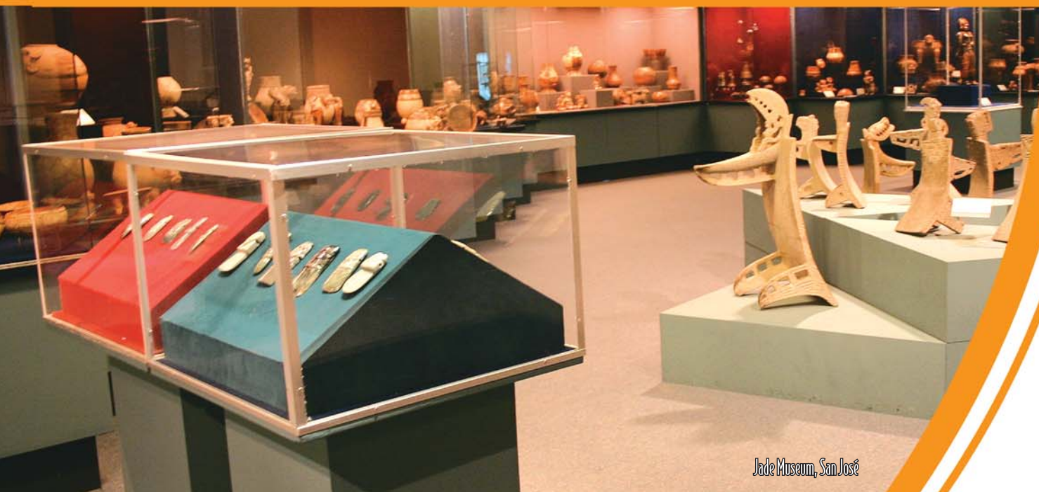
Jade Museum, San José

With such variety of options to see and do, it is like a whole world for you in one single journey! It's the kind of experience that will renew your spirit and you will always remember.