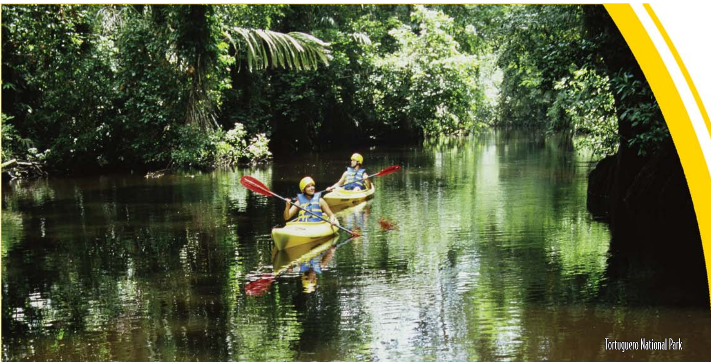
Tortuguero National Park