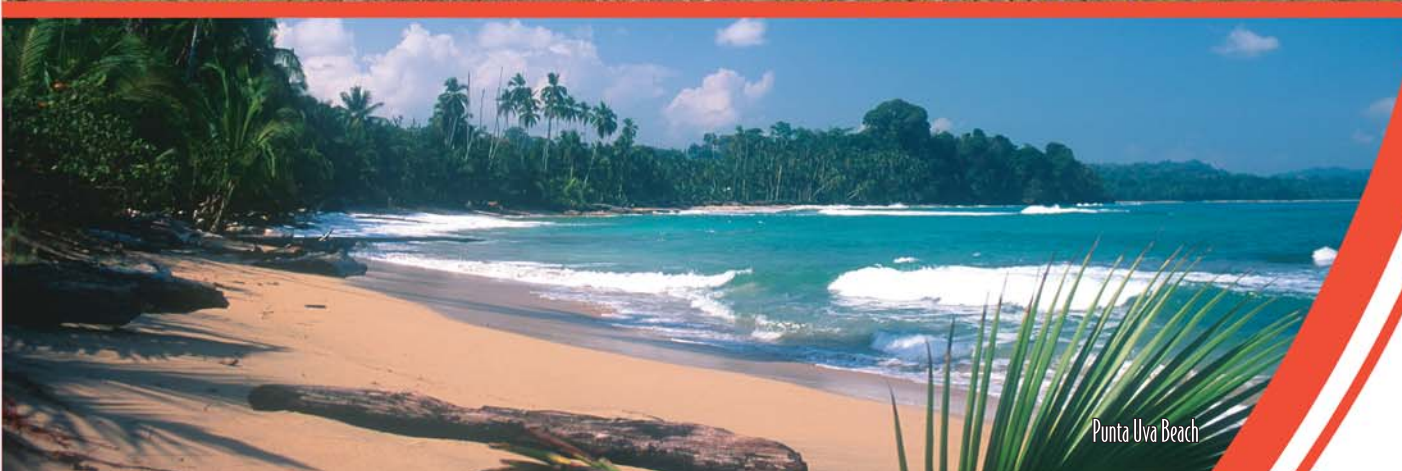
Punta Uva Beach