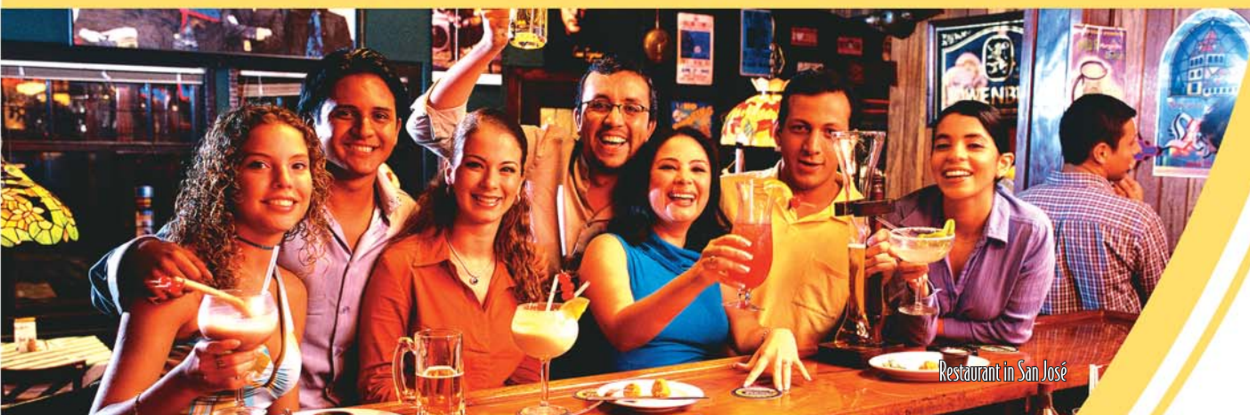
Restaurant in San José

Welcome to Costa Rica! The people's feeling of hospitality is reflected in the warmth of every smile Costa Ricans give you. That is not only a welcome greeting but a custom of friendliness and courtesy, a part of many pleasant moments to enjoy, in unimaginable places you will never forget.