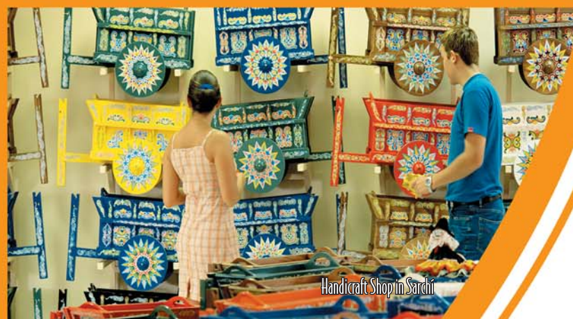
Handicraft Shop in Sarchi