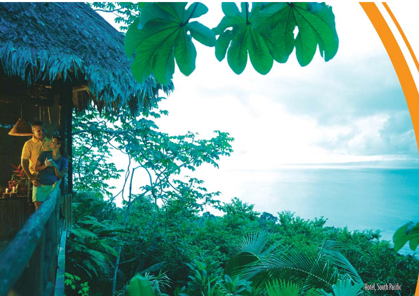
Hotel, South Pacific