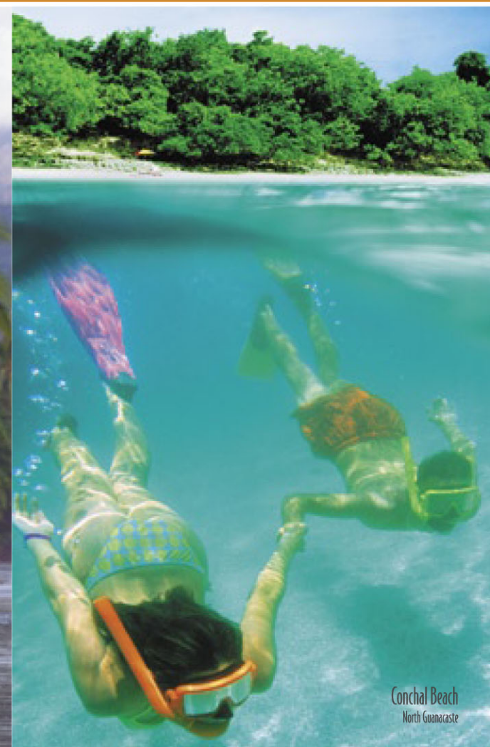
Conchal Beach North Guanacaste